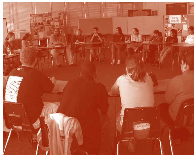
Above: Students and adults at the 2006 Schools for a New Society Learning Institute in San Diego debrief a site visit at a local high school.

SNS was not a ready-made design or model for all cities to adopt. Instead, it was a conceptual framework (see page 3) that cities used to transform high schools and school districts according to local needs and circumstances.